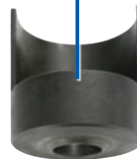
T40003 Removal Tool