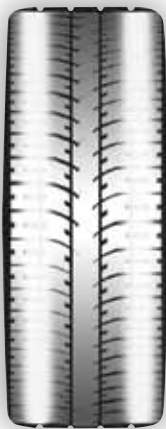
Inner/Outer Edge Wear

Camber that is out of specification will cause the vehicle to pull left or right and will create wear on the inside or outside edge of the tire.